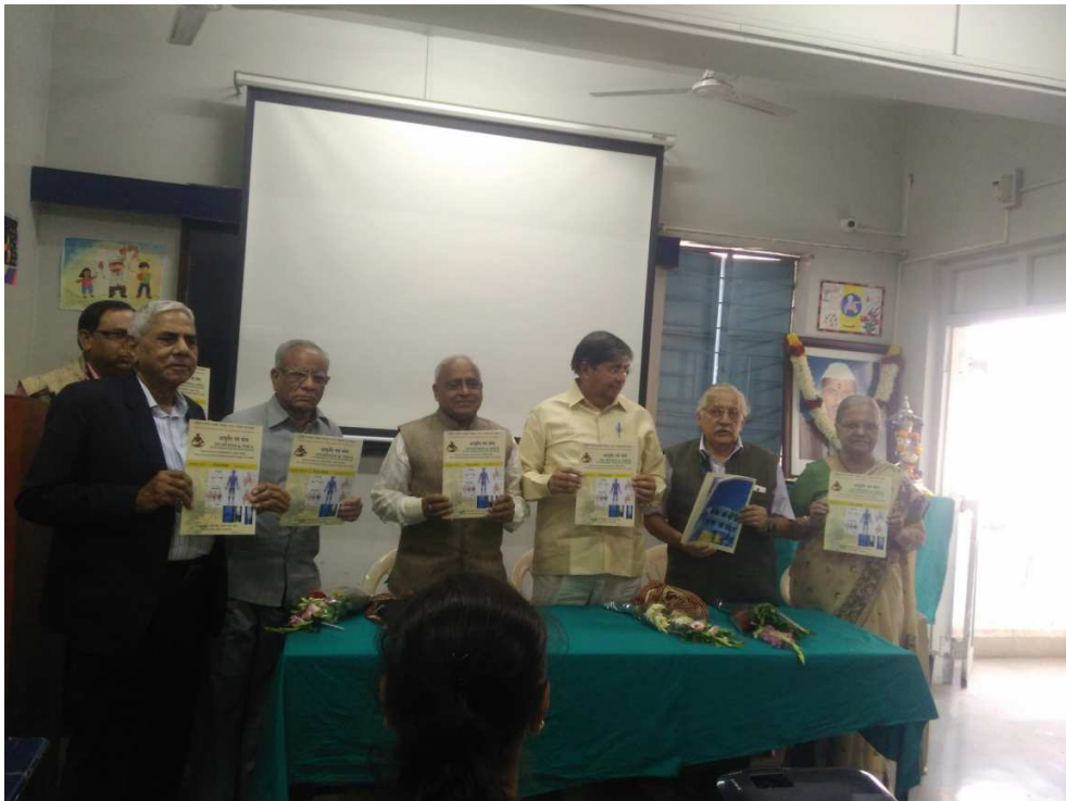
Release of XXVIII Souvenir of Ayurved and Yoga ( An international Journal of Life Sciences) Journal of All India Ayurvedic Specialists (P.G.) Association